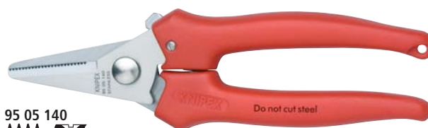
95 05 140 MM