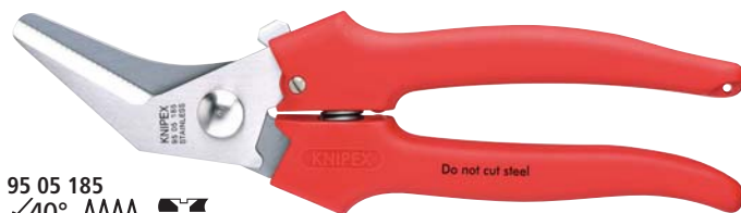
95 05 185 ∠40° MM