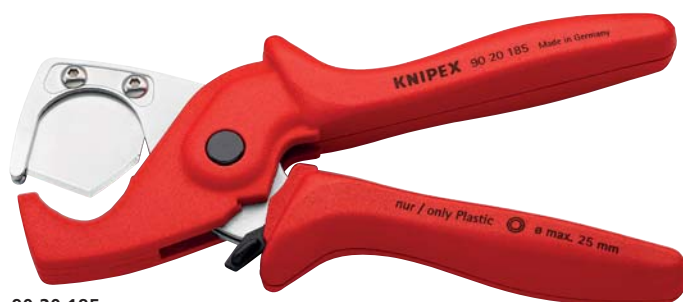
90 20 185 MM