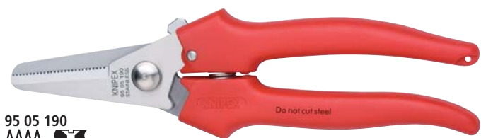
95 05 190 MM